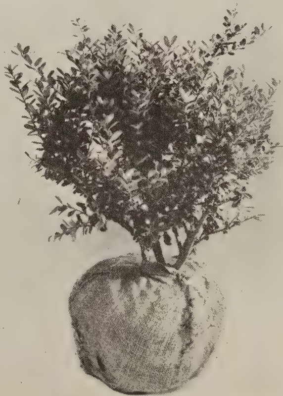
ILEX CRENATA ROTUNDIFOLIA